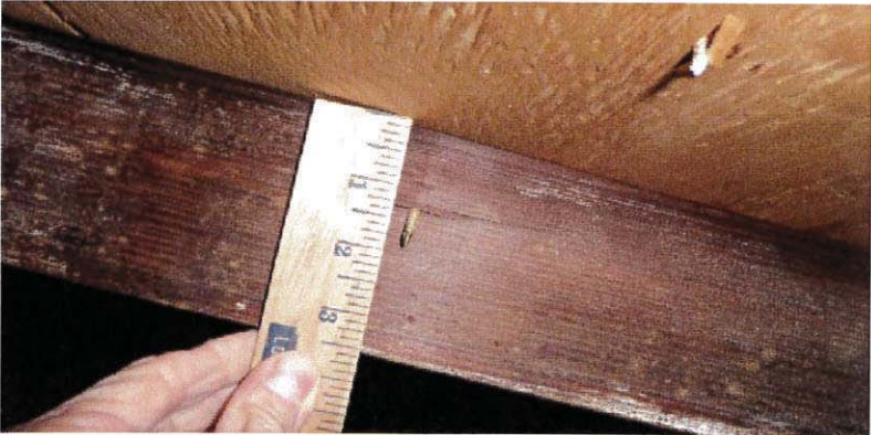
8d nails verified