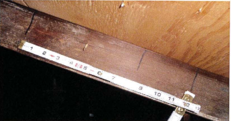
6" spacing in the field