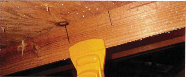
Nail location verified