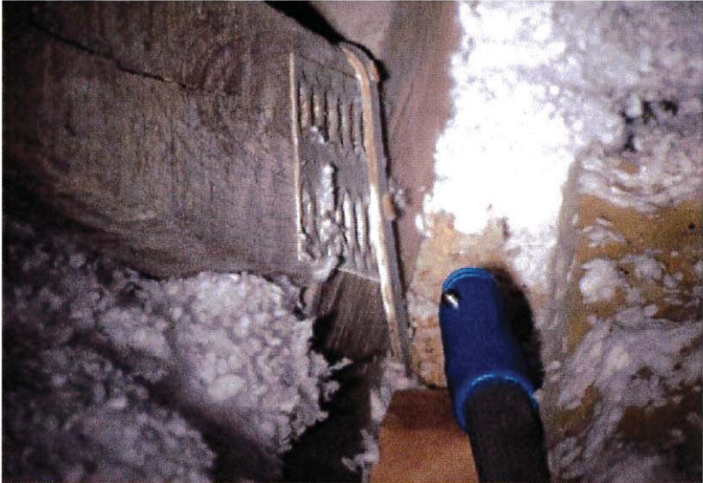
Single strap (clip) with 2 nails into the truss